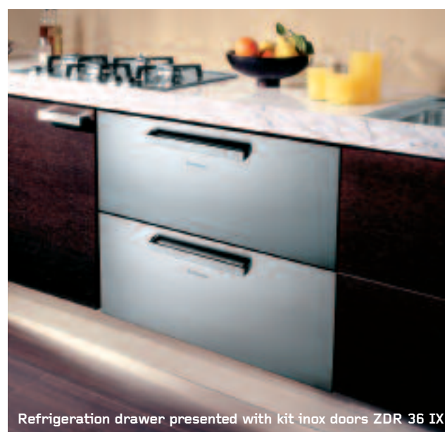
Refrigeration drawer presented with kit inox doors ZDR 36 IX

Its width allows it to fit in both a 90 cm European cabinet or a 36" American cabinet due to its side trim. Offering multiple design opportunities: 1) utilize the ZDR 36 IX and match the experience line design handle with other Ariston's appliances, 2) match your custom panel in your kitchen for a hidden and seamless styling, 3) or combine both our ZDR 36 IX and your custom panel for a unique design.